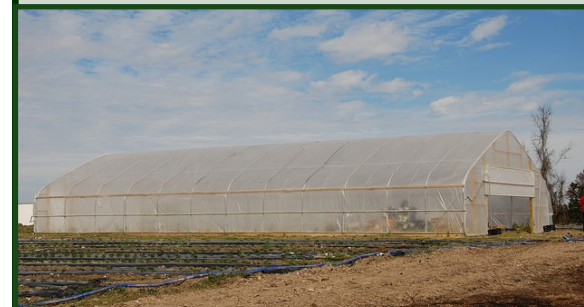
Seasonal High Tunnel

Consider, if the structure is removed, can a crop be planted in its place?